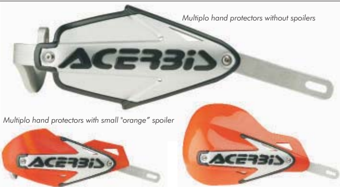
Multiplo hand protectors without spoilers

The latest innovation in hand protection: Multiplo hand protector brackets offer the highest level of resistance and strength thanks to the specially hardened aluminium Brackets. The replaceable screw-in hand protectors, consisting of an aluminium core, which may be fitted into two different size plastic Spoilers, are unique in function and design.